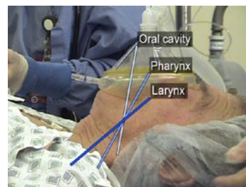
Figure 2. The "sniffing" position

In many cases, a neuromuscular-blocking agent and a potent sedative are needed to facilitate intubation. These agents will improve your visualization of the vocal cords and prevent the patient from vomiting and aspirating gastric contents. 3 If you plan