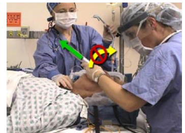
Figure 4. Proper orientation of the lifting action