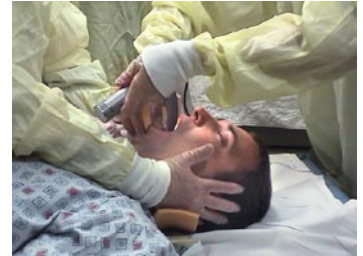
Figure 1. In-line stabilization of the cervical spine

N Engl J Med 2007;356:e15. Copyright © 2007 Massachusetts Medical Society.